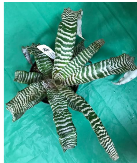
Crypto 'Very Cold Tooth'

Billbergia 'Ed McWilliams' x 'Colores' x saundersii