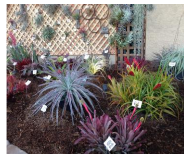
Detail of the 2016 fair display

We need a few volunteers to work on this fun project and maybe win a prize for SDBS again. Please stay for brief meeting after the March 11 meeting for an "ideas" meeting. The fair display will be in the same area as last year but the theme is "HOW THE WEST WAS FUN" and the display must have some props or backdrop to incorporate the theme. Ideas so far: gold mining, boots, cow skulls, saddle, bar... These are ok props, but how can we make it fun or funny? Bring your ideas, the wackier the better! Meet no more than 1/2 hr.