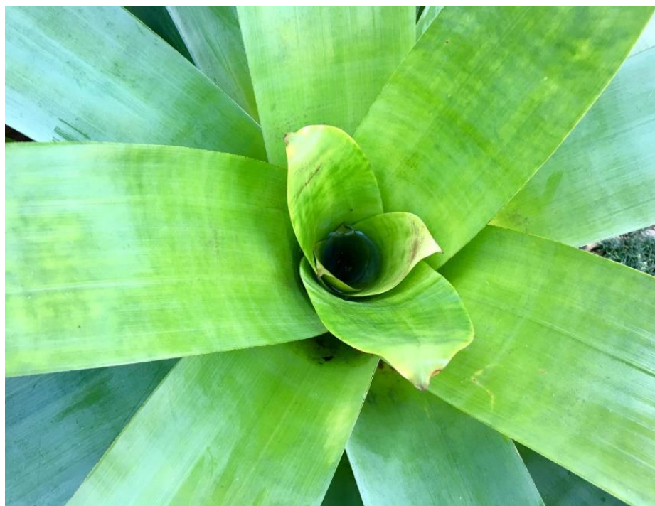
Alcantarea brasiliiana – holding over a gallon of water in its huge reservoir!

pot. I've had much better luck waiting until spring to propagate. That said, it is difficult to avoid the temptation to purchase a bare-root new specimen when something special comes along. Of course, this is not an uncommon predicament amongst us California tropical bromeliad enthusiasts.